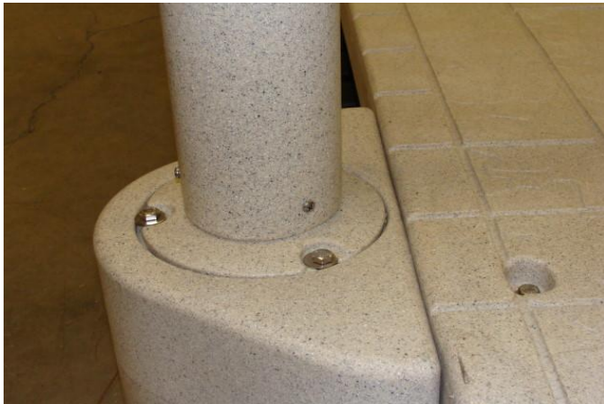
Self tapping screw attached