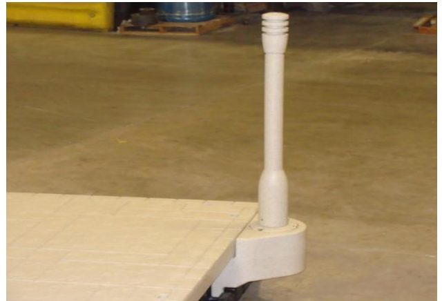
Post Cover attached and in place