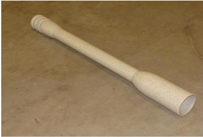
Part Shown: #1