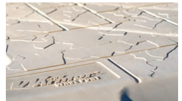
Extremely durable RotoMolded Shell. Filled with marine grade EPS foam for additional strength and superior integrity.