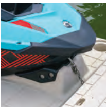
Bow stops help assist for soft and safe docking.