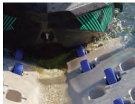
Innovative wheel design is self-adjusting 5 degrees each way with a shock absorbing soft surface.