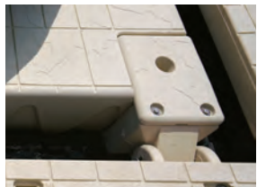
Wave Armor offers several mounting options, wheels and accessories to accommodate any PWC.